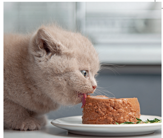
Wet pet food